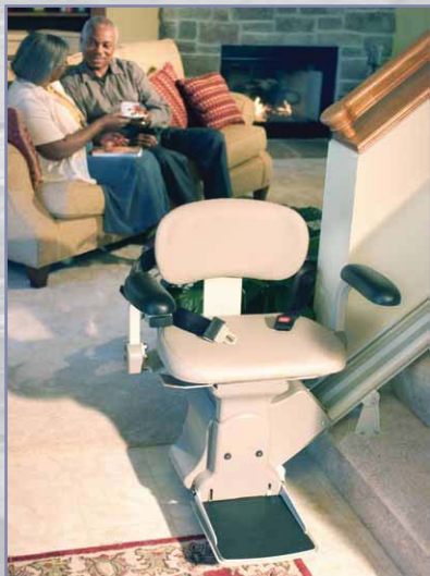
ELECTRA-RIDE™ LT Model SRE-2750