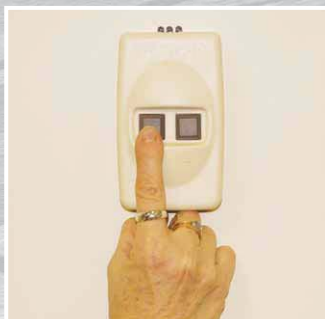
The two wireless call/send controls make the installation simple and clean with no wires running along the wall.

Easy on-and-off thanks to the Electra-Ride II's unique design.