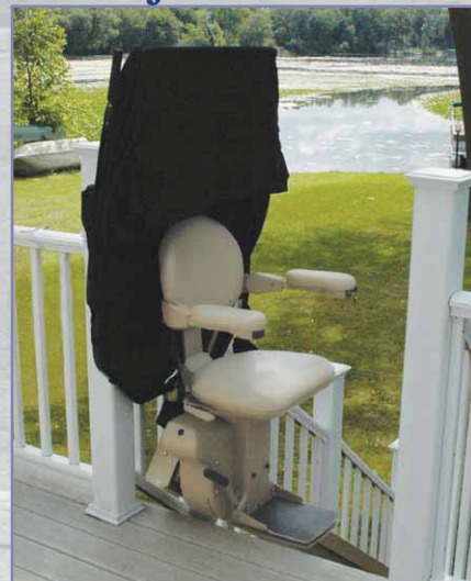
OUTDOOR ELECTRA-RIDE™ Model SRE-2010E The only 400 lb/ 181.8 kg capacity outdoor stairlift... an INDUSTRY EXCLUSIVE!