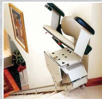
The arms, seat and footrest flip up, creating plenty of space for guests to walk up the stairs.