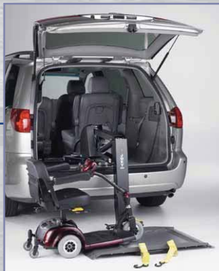
JOEY™ INTERIOR PLATFORM LIFT VSL-4000