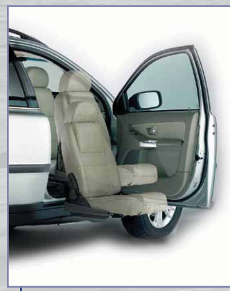
TURNY™ ORBIT® SEAT