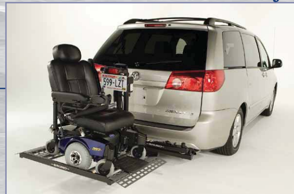
OUT-SIDER® MERIDIAN™ SERIES