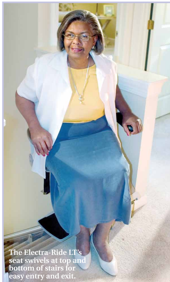
The Electra-Ride LT's seat swivels at top and bottom of stairs for easy entry and exit.