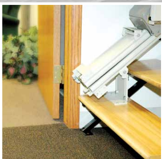
Folding rail option allows full clearance to doorways or hallways without rail obstruction.