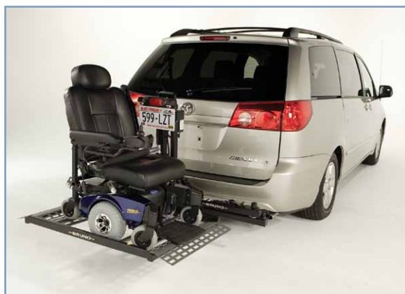
OUT-SIDER® MERIDIAN™ SERIES

OVER 20 DIFFERENT Vehicle Lifts INCLUDING: