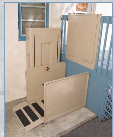
VERTICAL PLATFORM LIFT

OVER 20 DIFFERENT Vehicle Lifts INCLUDING: