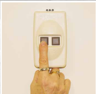
The two wireless call/send controls make installation simple and clean with no wires running along the wall.