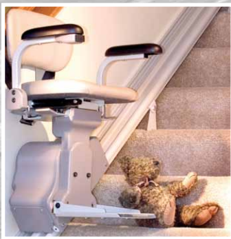
The footplate and carriage safety sensors safely stop you, even if the slightest obstacle is in the way while you ride!