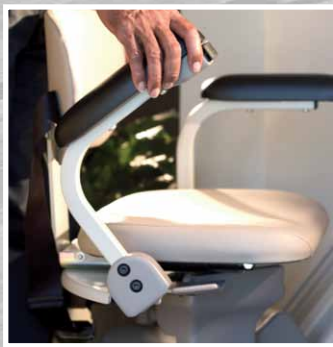
The arms flip up and out of the way for easy wheelchair transfer.

Using two 12-volt batteries that are powered by an unobtrusive battery charger plugged into a standard household outlet, the Electra-Ride LT features strip charge contacts for more flexibility when parking. You have access to your upstairs and downstairs, even if electrical service in your home is interrupted.