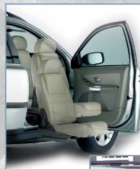
TURNY™ ORBIT SEAT

Revolutionary Turning Automotive Seating™ (TAS™)