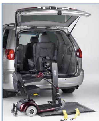
JOEY™ INTERIOR PLATFORM LIFT VSL-4000