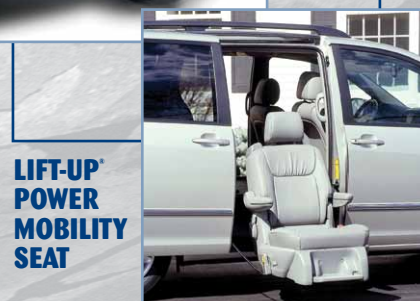
LIFT-UP® POWER MOBILITY SEAT